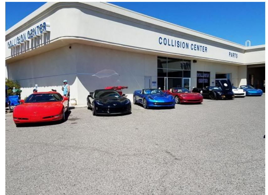
Our Corvettes at the Larry Green Chevrolet All Chevy Show