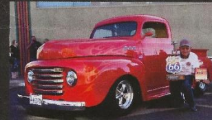
2020 BEST OF SHOW & Northern New Mexico Street Rodder's Choice Award

• "A Portion Of The Proceeds To Benefit American Legion Programs"