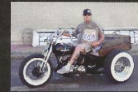
2020 BEST ANTIQUE MOTORCYCLE