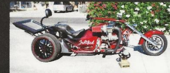
2020 BEST OF SHOW MOTORCYCLE